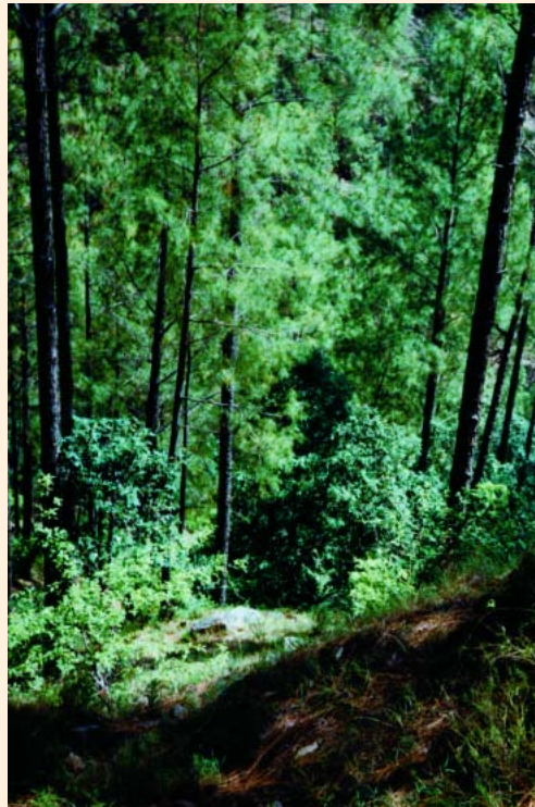
FIGURE 4 Common land under the control of the Forest Council, Almora District, Kumaon, 1993.

households can either monitor each other in the course of performing other tasks or be assigned monitoring responsibilities for a given duration. Under third party monitoring, specific persons have the power to ensure that others are following rules. But the payments for this specialized job can come from several different sources.