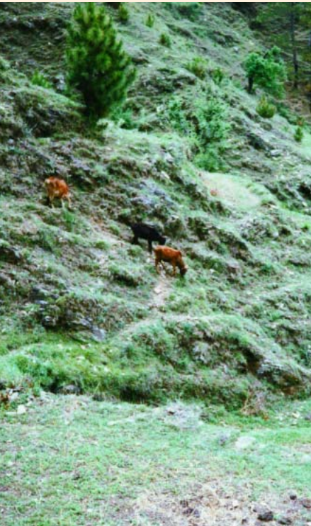
FIGURE 3 Common land under the control of the Revenue Department, Uttar Pradesh Government, 1993.