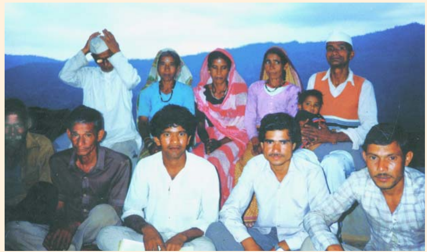
FIGURE 1 Members of a Forest Council in Ranikhet Development Block, Kumaon.

The governmentalization of communities went hand in hand with the creation of regulatory communities. This is perhaps the most critical aspect of any program of environmental decentralization. Lower level units in a territorial-administrative hierarchy, such as the forest councils, are granted powers of governance from a central authority. But in turn they are required to regulate the actions of their members—the common villagers—